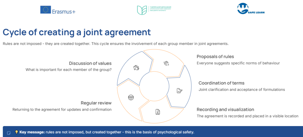
Fig. 3 The cycle of creating a common agreement

One of the important results of creating a safe educational environment is the formation of a learning community. This is a level of interaction at which participants feel involved in joint activities and responsible for their results (Fig. 3).