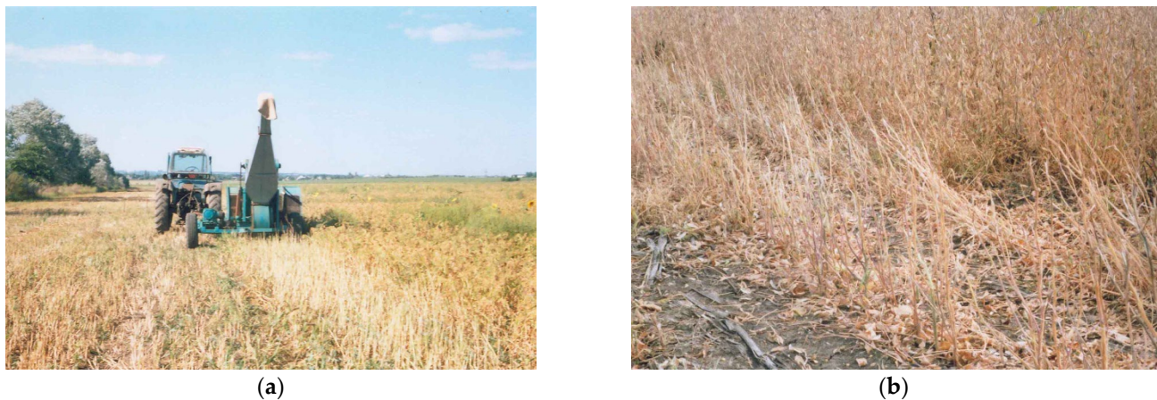
Figure 3. View of the field after the passage of the harvesting machine with combing working units: (a) millet field, (b) soybean field.

For experimental studies, a non-compositional rotatable three-level Box–Behnken design was chosen. Its distinctive feature is that in all the lines of the design some factors are at zero levels. To carry out the experiment, a matrix of experiment planning (Table 1) was used in which the lower level is marked with “−”, the upper level with “+”, and the middle level with “0”. The experiments were laid in fivefold repetition. To exclude heterogeneities of discrete and continuous types, the experiments were randomized. Randomization of experiments ensures the even application of the element of randomness under the influence of unmanageable and uncontrolled factors on the response. Randomization was performed by using tables of random numbers.