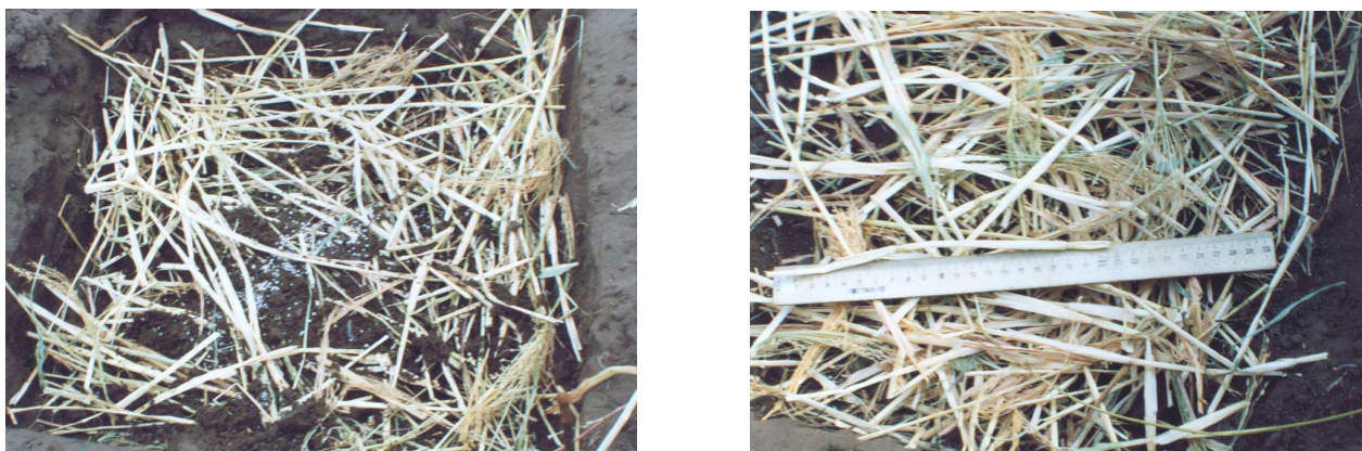
Figure 4. Layout of the experiments in the study of the straw decomposition process.

The experiments were laid out according to the matrix compiled. The layout of the experiments is shown in Figure 4.