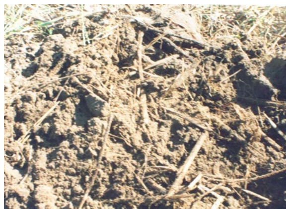
Figure 5. Leftover undecomposed straw at the end of the experiment.

As an example, let us consider in more detail the layout of the first experiment. For the first experiment, the first two factors are at their upper levels, and the third is at its middle level (Table 1). This means a straw length of 0.4 m, a nitrogen application dose of 20 kg/t (which is 9 g ammonium nitrate per pit), and a phosphorus application dose of 3 kg/t (2.4 g superphosphate per pit). After laying the straw and fertilizing, the pit was covered with soil and a plate with the number of experiences was installed. In the same way, all 15 experiments were laid, with a fivefold repetition of each one. At the end of the experiment (after 8 months), the pits were carefully excavated, the soil was sifted, and the leftover undecomposed straw (Figure 5) was weighed. The decomposition coefficient was calculated using Equation (1).