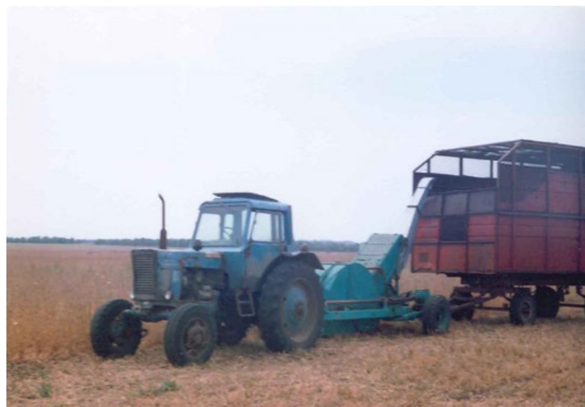
Figure 7. General view of the harvesting unit.

Let us consider the straw harvesting technology with a harvesting unit (Figure 7) (a tractor, a harvester equipped with a grinder, and a trailer-cart for collecting the combed heap). After the passage of the unit, the grain part of the crop is combed and supplied by the pneumatic conveyor to the trailer-cart, and the combed stalks are left in the field (combed straw, Figure 3). To harvest them, a rotary cutter is provided, which is mounted on the harvester. Its main purpose is to cut, grind, and scatter the combed stalks over the field. As a result, combed stalks of plants 0.22 m long are left in the field.