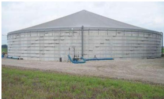
Fig. 4. Stainless steel manure pit

Manure pit sizes are made to ensure the effective application of mixing technology: The diameter should be between 4 to 25 m and the height of walls up to 7 meters. The height of the vertical wall above the ground level usually is set no lower than 180 to 190 cm.