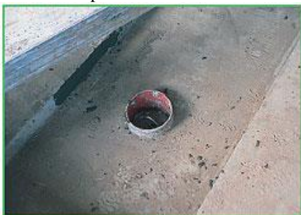
Fig. 2. Correct pit with a gradient of step

It is important not only to observe the correct geometry baths during construction but also follow them through since it has, for instance, been majorly observed that most bath operational staff often does not comply