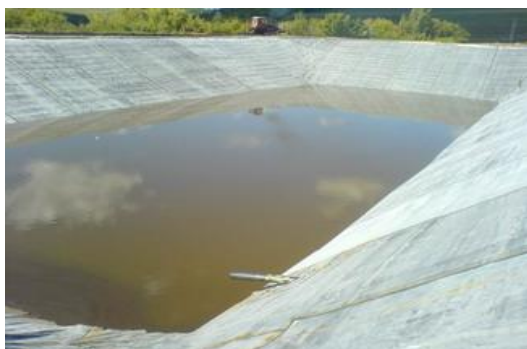
Fig. 5. Manure storage PVC film

In countries with weak economies, it is observed that the cheapest option is the buried or insulated film open manure storage. Manure storage are made from PVC film called “film” or often referred to as “lagoons” (Fig. 5). On the farm should be at least two manure storage lagoons that provide a consistent accumulation of 6-month aging (disinfection) and unloading for the spring-autumn application fields of the annual volume of manure.