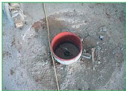
Fig. 1. Incorrect pit